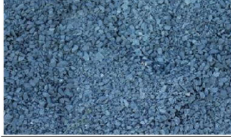
Fig .2 Fine Aggregate

The other sort of mixtures are those particles passing the 9.5 metric linear unit (3/8 in.) sieve, nearly entirely passing the 4.75 mm (No. 4) sieve, associate degree preponderantly preserved on the seventy five \mu\text{m} (No. 200) sieve are known as fine aggregate. For enlarged workability and for economy as mirrored by use of less cement, the fine aggregate ought to have a rounded shape. the aim of the fine aggregate is to fill the voids within the coarse aggregate and to act as a workability agent In concrete, an mixture is hired for its economic system factor, to reduce any cracks and most importantly to deliver energy to the structure. they're shown in fig.2