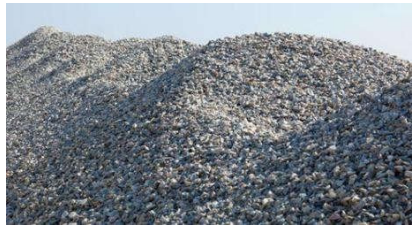
Fig.1 Coarse Aggregate

Coarse-grained mixtures won't tolerate a sieve with 4seventy five metric linear unit openings..Those particles that are preponderantly preserved on the 4.75 mm sieve and can pass through 3-inch screen, are referred to as coarse aggregate. The coarser the aggregate, the additional economical the mix. Larger items provide less area of the particles than identical volume of tiny pieces. Use of the biggest permissible maximum size of coarse aggregate permits a discount in cement and water requirements. exploitation aggregates larger than the utmost size of coarse aggregates permissible may end up in interlock and type arches or obstructions inside a concrete form. that enables the world below to become a void, or at best, to become crammed with finer particles of sand and cement solely and results during a weakened area. they're shown in fig.1 For Coarse Aggregates in Roads following properties are desirable Strength