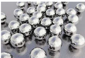
Fig 5 : Silver Nanoparticles

The researchers located that silver nanoparticles had a damaging end result on cells, suppressing cell increase and multiplication and causing necrobiosis relying on concentrations and duration of exposure. In particular, the two hundred nm silver debris brought on a concentration-structured boom in DNA harm within side the human cells.