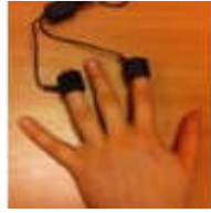
Fig. 3 GSR electrodes attached to fingers