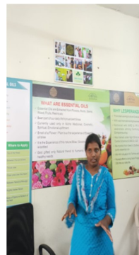
Fig 4. Ayurveda