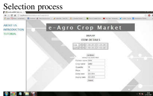
Fig.4 selection process